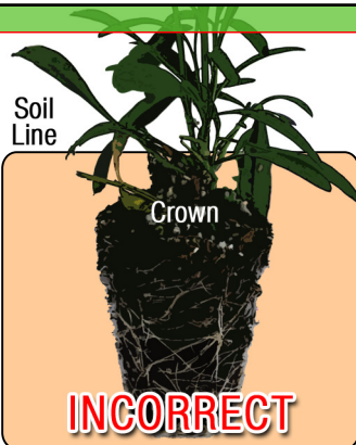
Do NOT bury the crown of the plug